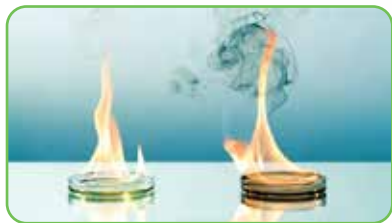
This image illustrates the cleanliness of HVO (left) in comparison to Kerosene (right), being burned.