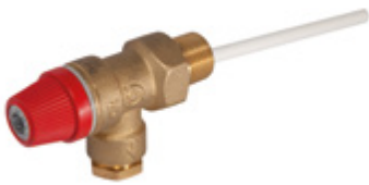
Temperature & pressure relief valve 1/2" NPT x 15mm (7 bar/90°C)