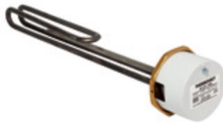
Immersion heater** 3kW - 14"